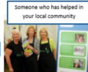
Someone who has helped in your local community