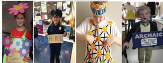
World Book Day Ideas

To add to the excitement, Reception and KS1 are invited to come to school dressed as their favourite book character and we would like the KS2 children to enter into the spirit of being 'word collectors' by taking part in a dress up day with a difference. Instead of coming to school dressed as a book character, we would like the children to come to school dressed as a word that is new or interesting to them. For example, this could be a word that they have found in their reading book that they did not know the meaning of; a word they have recently heard that they did not know the meaning of; a word they have used in the classroom. We are looking forward to celebrating the power of vocabulary at Brereton and can not wait to see some of the amazing costumes!