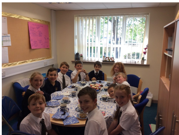
Congratulations to this weeks Dojo champions

We have a Facebook group - Brereton Primary School - PTA and email - ptabreretonprimary@gmail.com so please get in touch to get involved