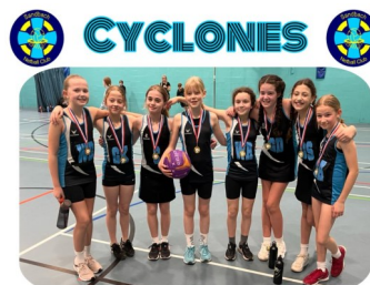
DIVISION 1 CHAMPIONS WARRINGTON JUNIOR LEAGUE YEAR 5/6

Congratulations to the girls who play for Sandbach Cyclones. They won division one in the Warrington league and have now been promoted to the premier league. A huge achievement